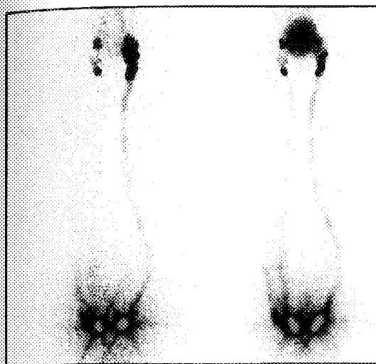
Fig. 2. Representative lymphoscintigram in a patient with lymphedema in the right lower extremity in whom minimal difference was detected before (A) and after drainage (B).

uptake. Fig. 2 shows a representative image in which no improvement was detected after drainage. In only six cases was an improvement detected after drainage, as shown in Fig. 3 .